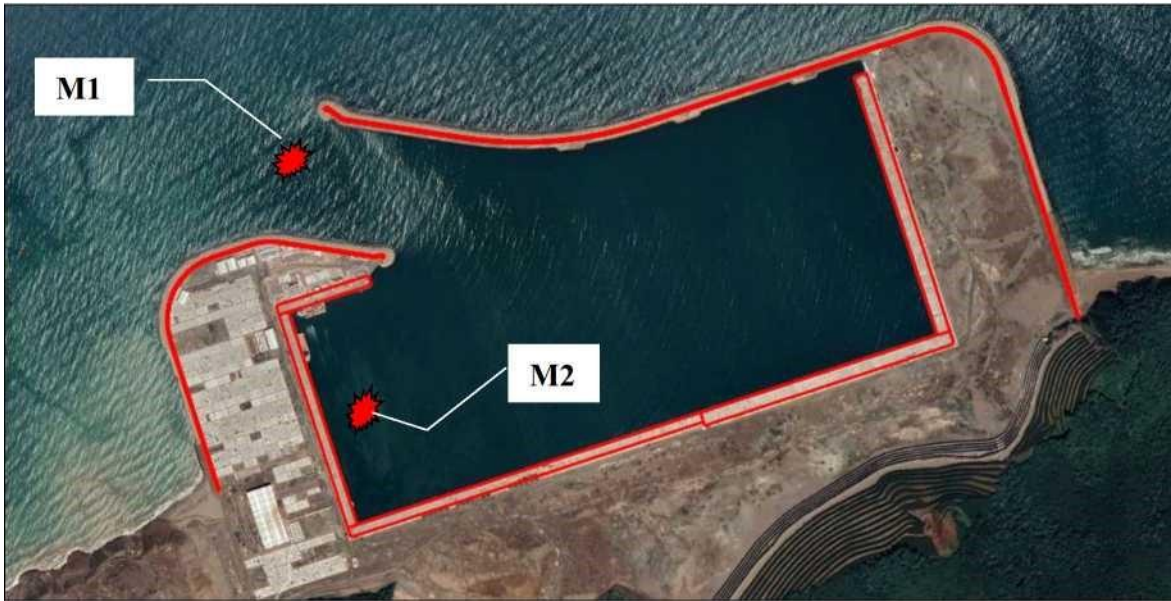
Figure 8-2: Accident points where simulations have been hypothesized (coastal area-port).